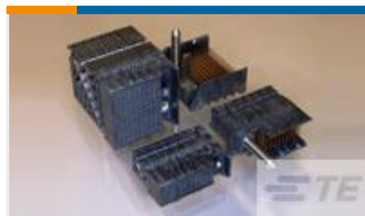
TE Part # 1-2132001-3 IMP100S,H,V6P14C,LG,OEW39,5.5