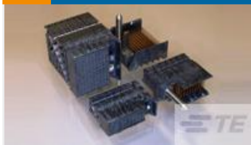
TE Part # 2132005-2 IMP100S,H,V6P14C,RG,OEW39,4.9