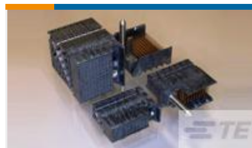
TE Part # 1-2132003-2 IMP100S,H,V6P14C,LG,REW39,4.9