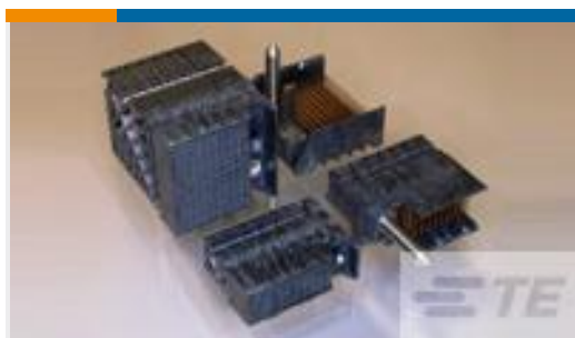
TE Part # 1-2132002-2 IMP100S,H,V6P14C,LG,REW46,4.9