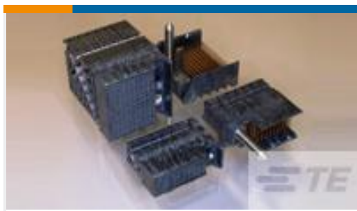
TE Part # 2132000-3 IMP100S,H,V6P14C,LG,OEW46,5.5