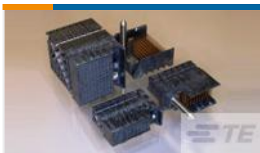
TE Part # 1-2132001-1 IMP100S,H,V6P14C,LG,OEW39,4.5