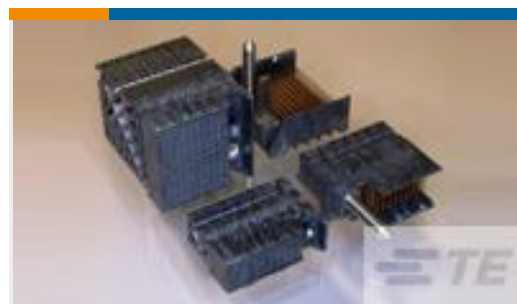
TE Part # 1-2132003-1 IMP100S,H,V6P14C,LG,REW39,4.5